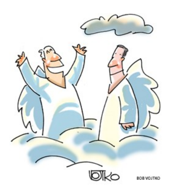
"This is heaven. You can have fries with everything."